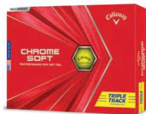
TRIPLE TRACK YELLOW