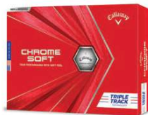
TRIPLE TRACK WHITE