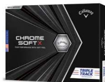
TRIPLE TRACK WHITE